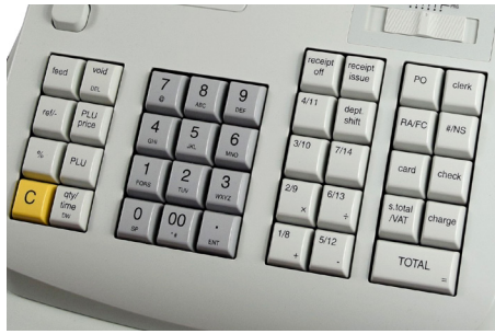
Big ergonomic keyboard