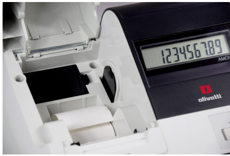
Easy paper roll loading